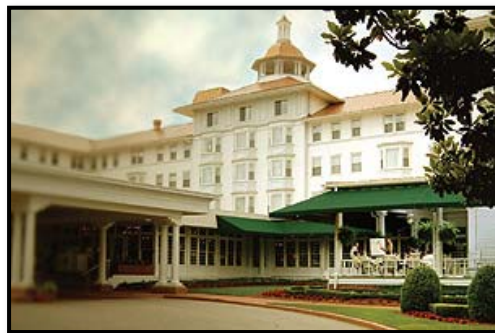
The Carolina Hotel

GASB 44 requires comparative data for the current calendar year and nine years prior. 2010 adjusted Census Data was used for 2009 and 2018 to estimate the percentage of total employment.