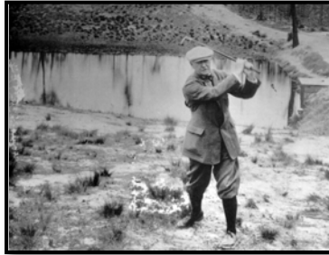
Donald Ross