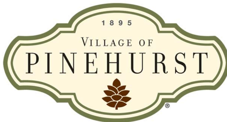
Village of Pinehurst Logo

According to the U.S. Census Bureau, adjusted for an annexed area effective March 31, 2010, Pinehurst had a population of 14,206 people in the year 2010. The 2010 population is a 61% increase from its population in 2000. Many of these new residents come from across the country, if not the world, to settle in this "village in the forest." When asked what brought them here, many cited ambiance, community character and spirit as their reasons for choosing the area.