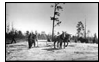
Development of Village Center

Since all of the early buildings of Pinehurst stood on barren land, Tufts hired Warren Manning to plant over 222,000 tree seedling and other plants (47,250 of these were imported from France) around Pinehurst to give the resort the natural beauty we all still enjoy today.