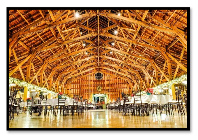
A Wedding Reception at the Fair Barn

The Fair Barn Division of the Parks and Recreation Department provides the management for the operations and maintenance of the Fair Barn. The Fair Barn is the oldest surviving early twentieth-century fair exhibition hall in North Carolina. It was built in 1917 and has been renovated to serve as a multipurpose community gathering place. The division also manages varying capital improvements to the facility and surrounding grounds and provides marketing and promotion for the Fair Barn.