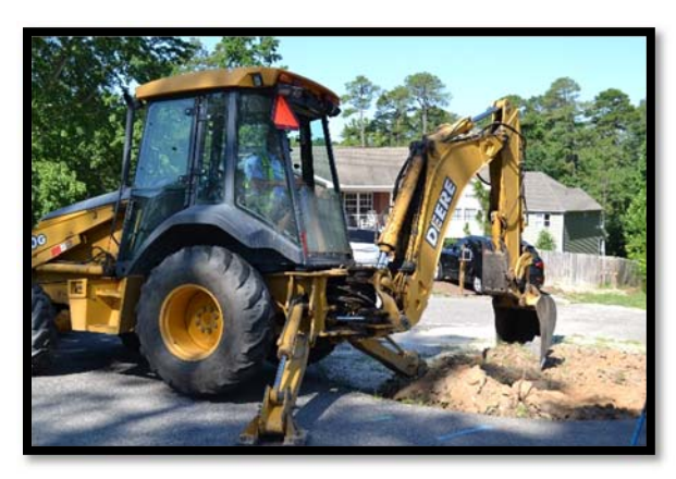
Streets & Grounds Employee at Work

The Streets & Grounds Division of the Public Services Department reports directly to the Public Services Director. The Streets & Grounds Division is responsible for keeping all public transportation routes open and in a safe traveling condition. This department maintains 107 miles of streets in the Village, the largest amount of any local government in Moore County. Routine tasks include asphalt patching, installing and maintaining storm drains, installing and maintaining traffic and street name signs, repairing sidewalks, street sweeping, and tree trimming. This division also provides the manpower, supplies and management for the maintenance of the Village owned right of ways and common areas.