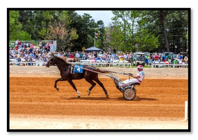
Matinee Race at Harness Track Facility

The Harness Track Division of the Parks and Recreation Department provides the labor, supplies, expertise, equipment, and management for the operations and maintenance of the Harness Track facility. This division manages major and minor capital improvements while providing services to the standardbred trainers and other equine and non-equine related clients of the property. The facility consists of multiple harness tracks, a show ring, and 285 horse stalls in 20 barns. In 2015, the Village celebrated the Harness Track's 100<sup>th</sup> anniversary.