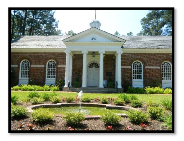
Given Memorial Library

Library services in the Village are provided by the Given Memorial Library, a non-profit 501(c)3. The Village makes an annual contribution toward the operational costs of the Library and has contributed to its capital expansion campaign. The library functions as a free public library and has a collection of over 23,000 items including fiction, non-fiction, audio books, e-books, and reference materials. In 2015, the library opened "The Outpost" in the former post office downtown. The facility serves as a used book store, coffee shop, and community gathering place. The Library also serves as the curator of the Tufts Archives and the Pinehurst History Museum.