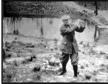
Donald Ross