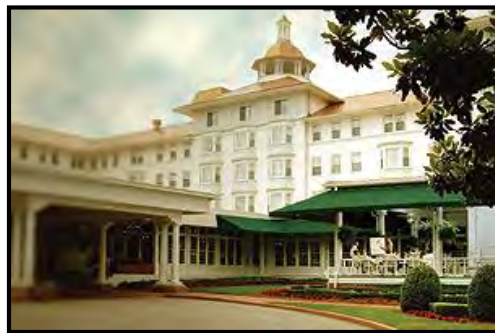
The Carolina Hotel

GASB 44 requires comparative data for the current calendar year and nine years prior. 2010 adjusted Census Data was used for 2008 and 2017 to estimate the percentage of total employment.