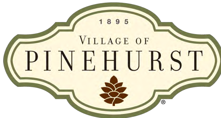
Village of Pinehurst Logo

According to the U.S. Census Bureau, adjusted for an annexed area effective March 31, 2010, Pinehurst had a population of 14,206 people in the year 2010. The 2010 population is a 61% increase from its population in 2000. Many of these new residents come from across the country, if not the world, to settle in this "village in the forest". When asked what brought them here, many cited ambiance, community character and spirit as their reasons for choosing the area.