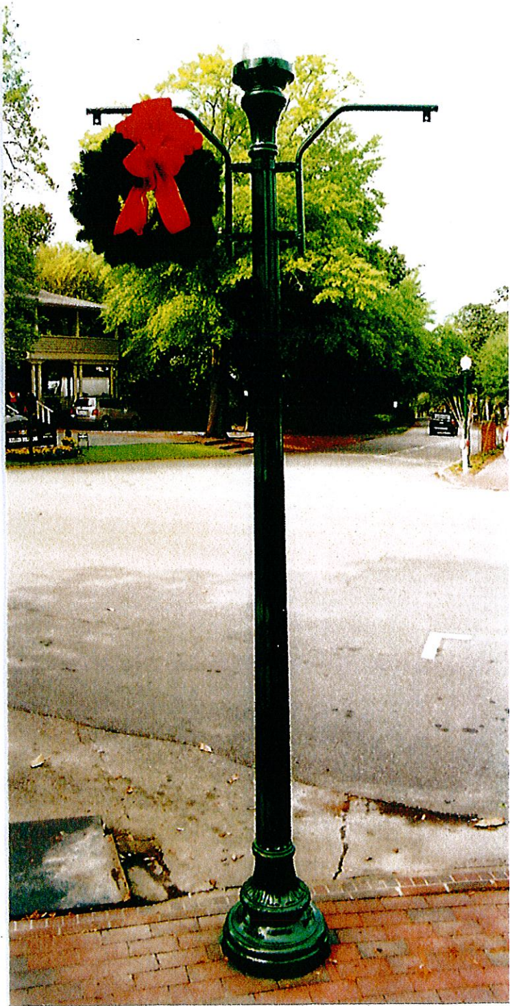
24" DOUBLE WREATH (Bow size to be reduced, and with longer tails)