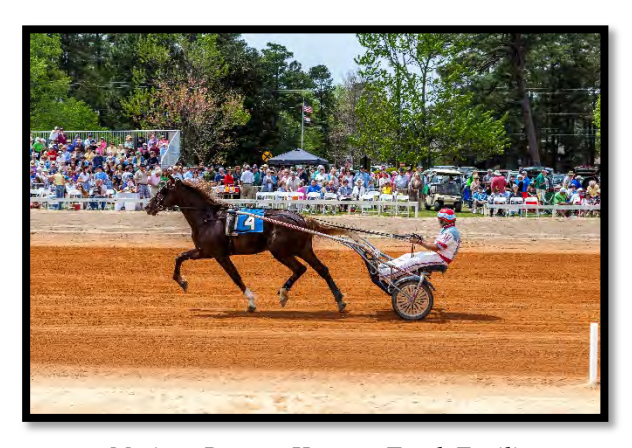
Matinee Race at Harness Track Facility

The Harness Track Division of the Parks and Recreation Department provides the manpower, supplies, expertise, equipment, and management for the operations and maintenance of the Harness Track facility. This division manages major and minor capital improvements while providing services to the standardbred trainers and other equine and non-equine related clients of the property. The facility consists of multiple harness tracks, a show ring, and 285 horse stalls in 20 barns. In 2015, the Village celebrated the Harness Track's 100<sup>th</sup> anniversary.