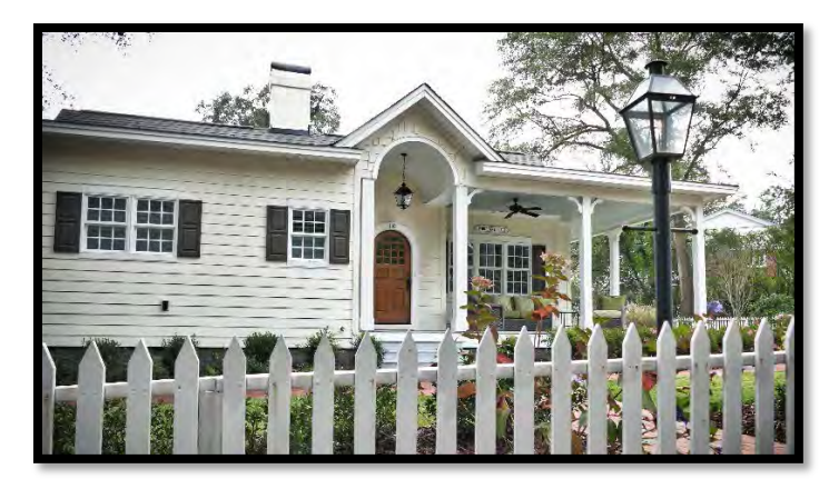
Village Historic District

The Historic Preservation Commission (HPC) recommends design standards and guidelines for the Local Historic District to the Village Council. The HPC reviews and acts upon requests for any work requiring a Certificate of Appropriateness for new construction, additions, building alterations and demolitions within the Local Historic District. The HPC also recommends to the Village Council areas to be designated as "Historic Districts" and individual structures, buildings, sites, areas, or objects to be designated as "Landmarks".