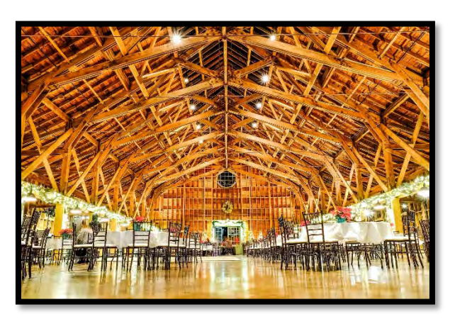
A Wedding Reception at the Fair Barn

The Fair Barn Division of the Parks and Recreation Department provides the management for the operations and maintenance of the Fair Barn. The Fair Barn is the oldest surviving early twentieth-century fair exhibition hall in North Carolina. It was built in 1917 and has been renovated to serve as a multipurpose community gathering place. The division also manages varying capital improvements to the facility and surrounding grounds and provides marketing and promotion for the Fair Barn.