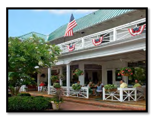
Historic Downtown Business District

The Village of Pinehurst is known for its award-winning golf resorts and quaint, idyllic charm, but many people don't realize that our local government is comprised of 18 different departments and divisions working to maintain the high expectations of the Village's citizens and visitors. As such, it is often difficult to know who to contact for more information about the Village of Pinehurst's available services.