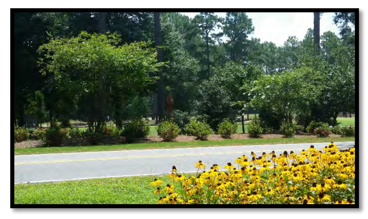
Village Street and Right-of-Way

The Streets and Grounds Division of the Public Services Department reports directly to the Director of Public Services. The Streets and Grounds Division is responsible for keeping all public transportation routes open and in a safe traveling condition. This department maintains 107 miles of streets in the Village, the largest amount of any local government in Moore County. Routine tasks include asphalt patching, installing and maintaining storm drains, installing and maintaining traffic and street name signs, repairing sidewalks, street sweeping, and tree trimming. This division also provides the manpower, supplies and management for the maintenance of the Village owned right of ways and common areas.