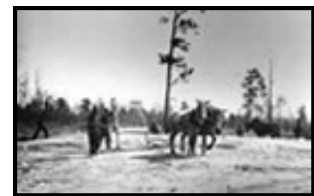
Development of Village Center

Since all of the early buildings of Pinehurst stood on barren land, Tufts hired Warren Manning to plant over 222,000 tree seedling and other plants (47,250 of these were imported from France) around Pinehurst to give the resort the natural beauty we all still enjoy today.