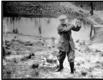
Donald Ross