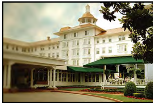
The Carolina Hotel

GASB 44 requires comparative data for the current calendar year and nine years prior. 2010 adjusted Census Data was used for 2007 and 2016 to estimate the percentage of total employment.