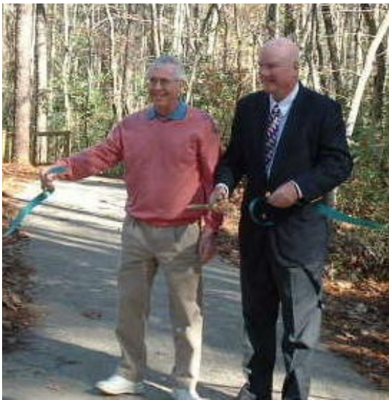
Phase I and

The Pinehurst Greenway Committee and the Pinehurst Parks and Recreation Department held a Ribbon Cutting Ceremony to officially open the first phase of the Greenway System on Wednesday, December 1 st . The ceremony was held behind the FirstHealth Center for Health and Fitness between two boardwalks that were built by FirstHealth to cross over a wetland area along a portion of the trail.