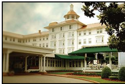
The Carolina Hotel

2013 and 2004 data are for tax years 2012 and 2003 respectively.