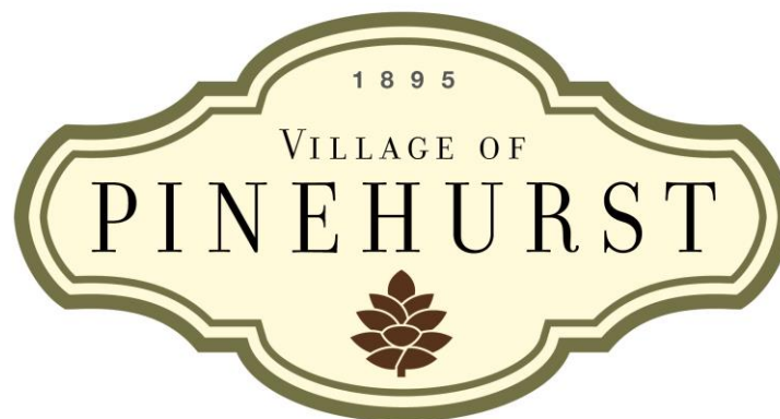
Village of Pinehurst Logo

According to the U.S. Census Bureau, adjusted for an annexed area effective March 31, 2010, Pinehurst had a population of 14,206 people in the year 2010. The 2010 population is a 61% increase from its population in 2000. Many of these new residents come from across the country, if not the world, to settle in this "village in the forest". When asked what brought them here, many cited ambiance, community character and spirit as their reasons for choosing the area.