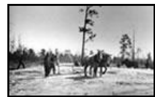
Development of Village Center

Since all of the early buildings of Pinehurst stood on barren land, Tufts hired Warren Manning to plant over 222,000 tree seedling and other plants (47,250 of these were imported from France) around Pinehurst to give the resort the natural beauty we all still enjoy today.