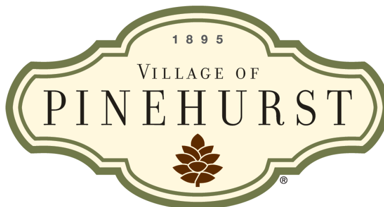
Village of Pinehurst Logo

According to the U.S. Census Bureau, adjusted for an annexed area effective March 31, 2010, Pinehurst had a population of 14,206 people in the year 2010. The 2010 population is a 61% increase from its population in 2000. Many of these new residents come from across the country, if not the world, to settle in this "village in the forest". When asked what brought them here, many cited ambiance, community character and spirit as their reasons for choosing the area.