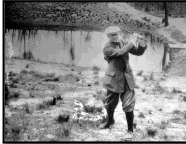
Donald Ross