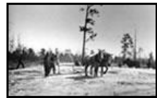
Development of Village Center

Since all of the early buildings of Pinehurst stood on barren land, Tufts hired Warren Manning to plant over 222,000 tree seedling and other plants (47,250 of these were imported from France) around Pinehurst to give the resort the natural beauty we all still enjoy today.