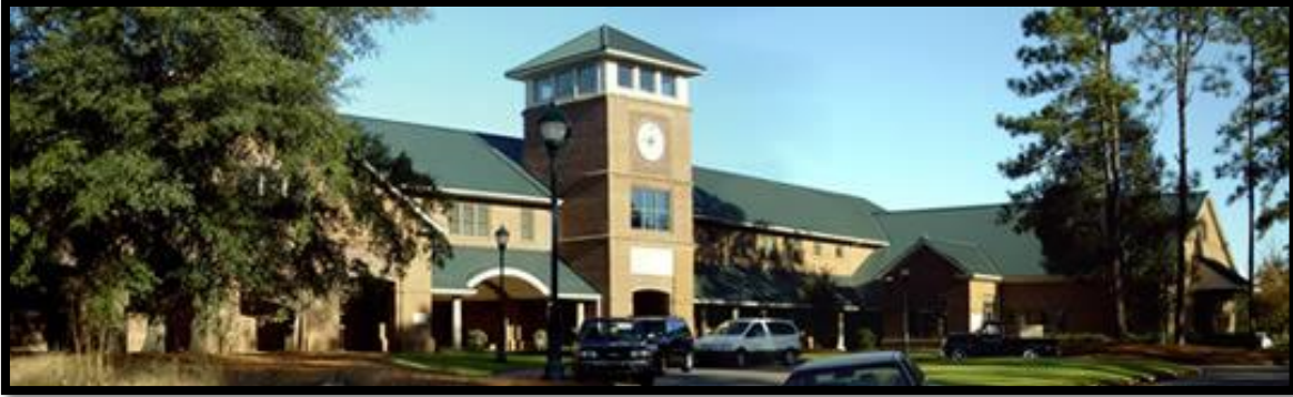
The Pinehurst Village Hall, located at 395 Magnolia Road

Welcome to the Village of Pinehurst! This Strategic Operating Plan (SOP) document represents the plans of the Village Council and staff to achieve our vision and accomplish our mission. We hope this document will prove to be a valuable tool for Village citizens, businesses, visitors, Council, and staff.