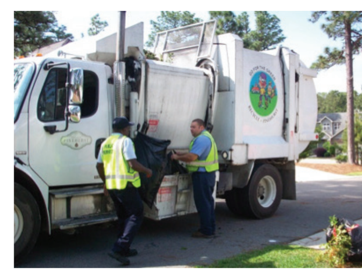
Village employees collecting yard debris

Over the last several years, the Village has increased its efficiency in the delivery of trash and recycling pickup services through automation. Currently, yard debris collection is a manual task requiring up to three handlings of the debris before it ends up at the landfill. By automating this service, the Village reduces that to one handling resulting in a savings of approximately 6,600 labor hours per year. It also allows the Village to restructure collection zones so that each service is provided on the same day in your neighborhood. While the number of carts placed curbside on collection day will increase, the appearance of the Village is improved by virtue of the carts being out only one day