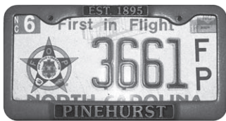
Example of an illegal license plate frame.

The Pinehurst Police Department would like to remind everyone of a new law. The NC State Legislature added a new license plate