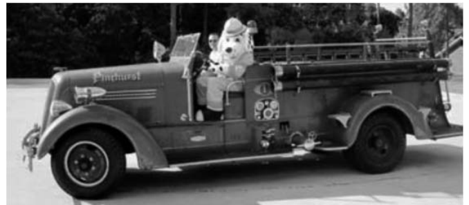
1937 Seagrave model Pinehurst Fire Truck

A piece of Pinehurst history was returned on March 24, 2010 when an antique dealer from Landis, NC returned the fire engine that was used in the Village from October 1937 until May 1973. Efforts are underway to restore the fire engine to its former glory and a fund has been established for the effort. The restored fire engine will be used for public education projects, exhibits and civic events. Additional information about the truck and sponsorship opportunities may be found by visiting the fire department page on the Village website www.villageofpinehurst.org or by calling the Fire Station at 295-5575.