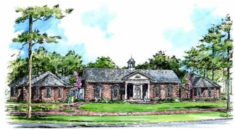
Rendering of expanded Given Memorial Library.

and the library has expanded programming and services, the physical facility has remained unchanged. The library is excited to better serve their patrons, community, and visitors, enriching and enhancing the Village of Pinehurst.