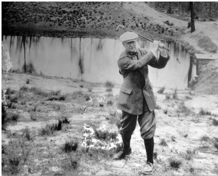
Donald Ross

For many years, Pinehurst was a privately held resort under sole proprietorship of the Tufts family. The Tufts family controlled all aspects of the resort and closely monitored all types of activities, including the creation of its first 9-hole golf course in February 1898, and the continued acquisition of more land.