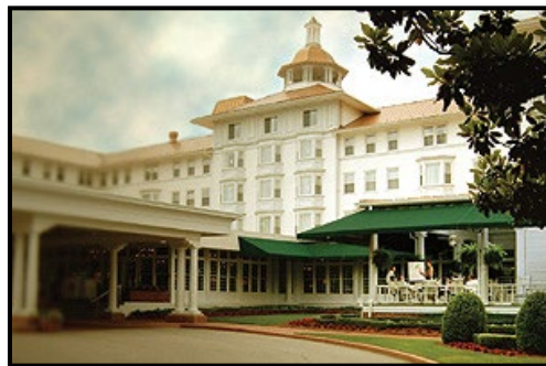
The Carolina Hotel

GASB 44 requires comparative data for the current calendar year and nine years prior. 2010 adjusted Census Data was used for 2012 and 2021 to estimate the percentage of total employment.