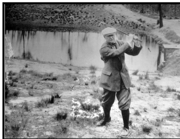
Donald Ross