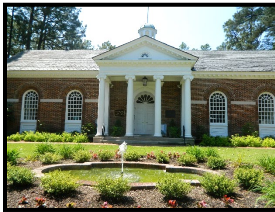
Given Memorial Library

Library services in the Village have historically been provided by the Given Memorial Library, a non-profit 501(c)3. The Village recently conducted a formal library needs assessment to determine the community's desires and needs for enhanced library services. In March 2021, the Village of Pinehurst Council and Given Memorial Library and Tufts Archives Board signed a letter of intent indicating an agreement to transfer assets and operations of the library and archives to the Village. In April 2022, the final transfer agreement was executed, which brought the library and archives into the Village's suite of services. The library functions as a free public library and has a collection of over 23,000 items including fiction, non-fiction, audio books, e-books, and reference materials. The library also serves as the curator of the Tufts Archives and the Pinehurst History Museum.