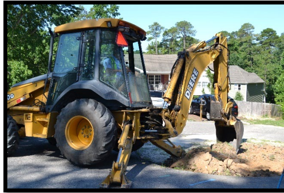
Streets & Grounds Employee at Work

The Streets & Grounds Division of the Public Services Department reports to the Assistant Public Services Director. The Streets & Grounds Division is responsible for keeping all public transportation routes open and in a safe traveling condition. This department maintains 107 miles of streets in the Village, the largest amount of any local government in Moore County. Routine tasks include asphalt patching, installing and maintaining storm drains, installing and maintaining traffic and street name signs, repairing sidewalks, street sweeping, and tree trimming. This division also provides the manpower, supplies and management for the maintenance of the Village owned right of ways and common areas.