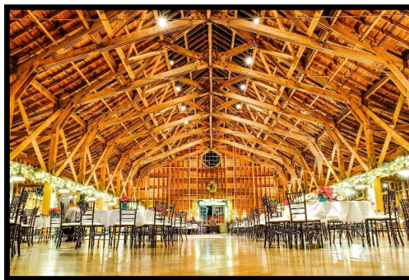
A Wedding Reception at the Fair Barn

The Fair Barn Division of the Parks and Recreation Department provides the management for the operations and maintenance of the Fair Barn. The Fair Barn is the oldest surviving early twentieth-century fair exhibition hall in North Carolina. It was built in 1917 and has been renovated to serve as a multi-purpose community gathering place. The division also manages varying capital improvements to the facility and surrounding grounds and provides marketing and promotion for the Fair Barn.