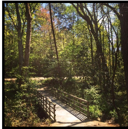
Greenway Trail at Rassie Wicker Park

The Buildings & Grounds Division reports directly to the Parks & Recreation Director. It is responsible for providing regular and preventative maintenance for all buildings owned by the Village and also for the grounds maintenance in the various parks and other facilities. This division coordinates repairs for all heating systems, electrical systems, and any other building systems as needed. The Buildings & Grounds Division is also responsible for miscellaneous building maintenance, such as replacing light bulbs, routine cleaning of system filters, mowing turf areas, upkeep of parks and greenway trails, and maintaining trees and shrubs.