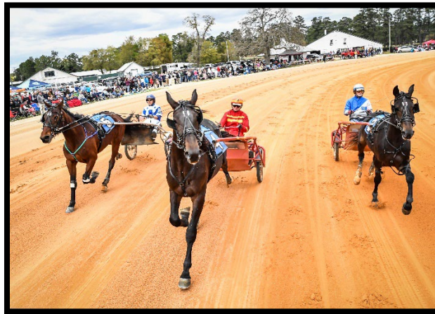
Matinee Race at Harness Track Facility

The Harness Track Division of the Parks and Recreation Department provides the labor, supplies, expertise, equipment, and management for the operations and maintenance of the Harness Track facility. This division manages major and minor capital improvements while providing services to the standardbred trainers and other equine and non-equine related clients of the property. The facility consists of multiple harness tracks, a show ring, and 244 horse stalls in 17 barns. In 2015, the Village celebrated the Harness Track's 100 th anniversary.