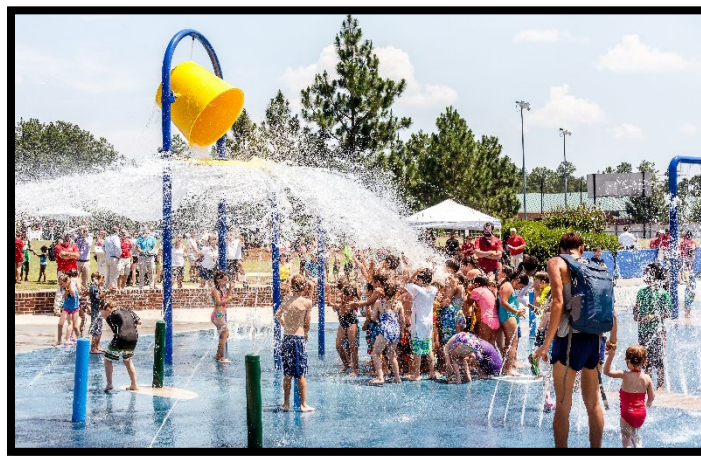
Splash Pad at Rassie Wicker Park

The Parks & Recreation Director reports directly to the Assistant Village Manager of Operations and is a member of the senior leadership team. This department is charged with providing the citizens of Pinehurst with a variety of recreational pursuits that permit the participants to truly enrich the quality of their lives. Leisure services provided give the participants the opportunity to learn and respect their abilities, strengths, and weaknesses as they move toward self-fulfillment and self-actualization of their expected potentials in life. Year-round programming includes classes, workshops, special events, facility rentals, athletic leagues, and camps. The department also coordinates activities at Cannon Park, Rassie Wicker Park (including the Arboretum), West Pinehurst Park, Tufts Park, and the Cannon Park Community Center.