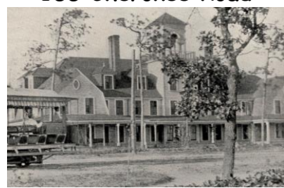
What is this building now? The Holly Inn

What has changed since this picture? <u>Porch removed, Peak roof and columns</u> added, center cupola, entrance changed