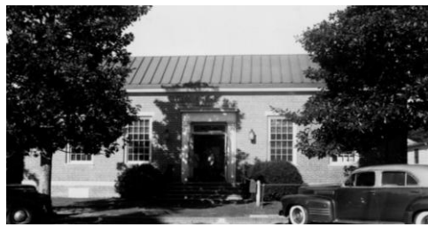
95 Cherokee Road

What two businesses are in this building now? Given Book Shop and Roast Office <u>Coffee Shop</u>