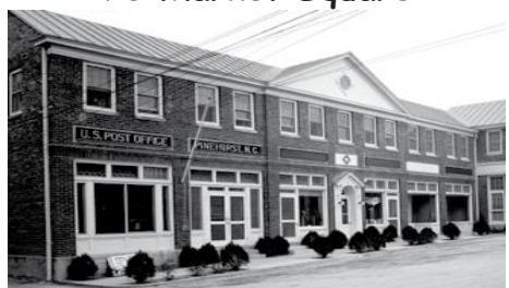
70 Market Square

What businesses are found here now? Teramasu, Ten Ya, Carolina Philharmonic, Bump & Baby, Dugans