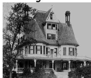
65 Magnolia Road

What happens in this building now? The Magnolia Inn is an Inn and Resturant