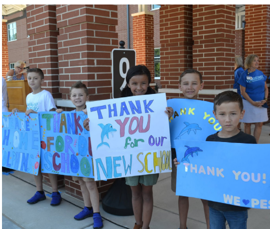
The VOP celebrated the official opening of the new Pinehurst Elementary School.

Follow @vopnc on Facebook for hyper-local information you don't want to miss.