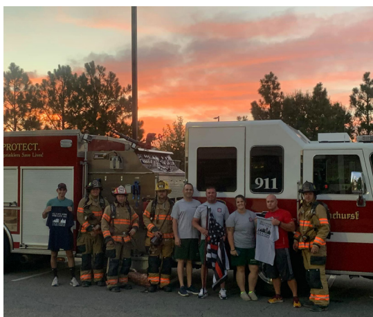
On September 11, members of the Pinehurst Fire Department climbed 110 flights of stairs in remembrance of the fallen heroes.