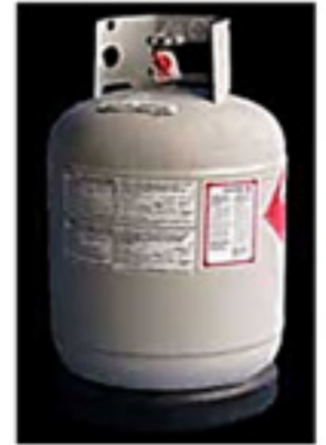
50 LB Cylinder 27.5" x 15"