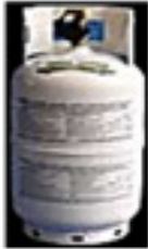
11 LB Cylinder 17.5" x 9"