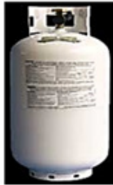
30 LB Cylinder 24" x 12.25"