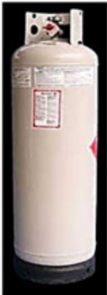
60 LB Cylinder 44.5" x 12.5"