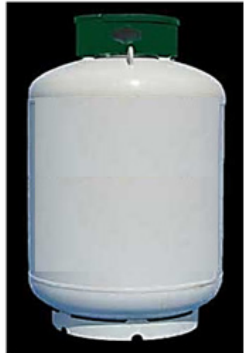
420 LB Cylinder 52.5" x 30"