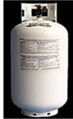
40 LB Cylinder 29.5" x 12.25"