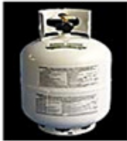
20 LB Cylinder 18" x 12.25"