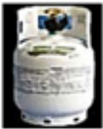
5 LB Cylinder 12" x 8.5"