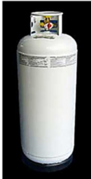
100 LB Cylinder 48.5" x 15"