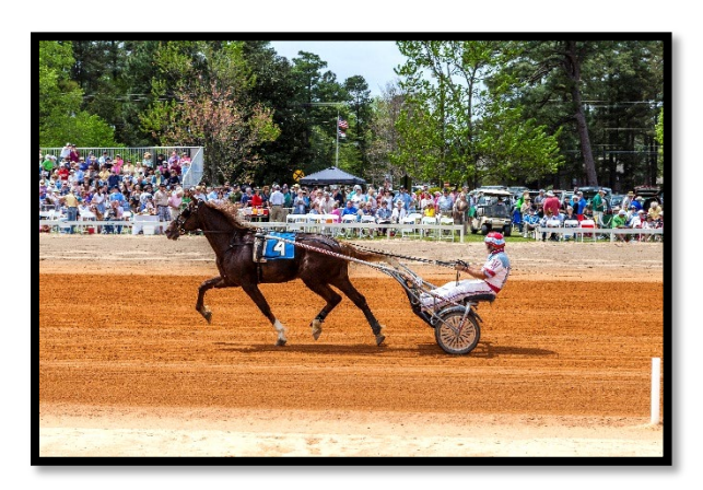
Matinee Race at Harness Track Facility

The Harness Track Division of the Parks and Recreation Department provides the labor, supplies, expertise, equipment, and management for the operations and maintenance of the Harness Track facility. This division manages major and minor capital improvements while providing services to the standardbred trainers and other equine and non-equine related clients of the property. The facility consists of multiple harness tracks, a show ring, and 244 horse stalls in 17 barns. In 2015, the Village celebrated the Harness Track's 100<sup>th</sup> anniversary.