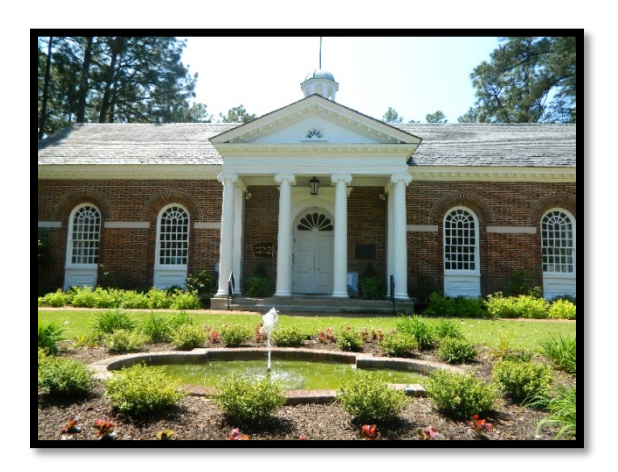
Given Memorial Library

Library services in the Village have historically been provided by the Given Memorial Library, a non-profit 501(c)3. The Village recently conducted a formal library needs assessment to determine the community's desires and needs for enhanced library services. In March 2021, the Village of Pinehurst Council and Given Memorial Library and Tufts Archives Board signed a letter of intent indicating an agreement to transfer assets and operations of the library and archives to the Village in FY 2022. The library functions as a free public library and has a collection of over 23,000 items including fiction, non-fiction, audio books, e-books, and reference materials. The Library also serves as the curator of the Tufts Archives and the Pinehurst History Museum.