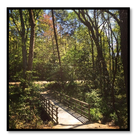
Greenway Trail at Rassie Wicker Park

The Buildings & Grounds Division reports directly to the Parks & Recreation Director. It is responsible for providing regular and preventative maintenance for all buildings owned by the Village and also for the grounds maintenance in the various parks and other facilities. This division coordinates repairs for all heating systems, electrical systems, and any other building systems as needed. The Buildings & Grounds Division is also responsible for miscellaneous building maintenance, such as replacing light bulbs, routine cleaning of system filters, mowing turf areas, upkeep of parks and greenway trails, and maintaining trees and shrubs.