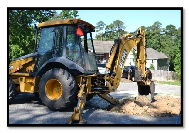
Streets & Grounds Employee at Work

The Streets & Grounds Division of the Public Services Department reports to the Assistant Public Services Director. The Streets & Grounds Division is responsible for keeping all public transportation routes open and in a safe traveling condition. This department maintains 107 miles of streets in the Village, the largest amount of any local government in Moore County. Routine tasks include asphalt patching, installing and maintaining storm drains, installing and maintaining traffic and street name signs, repairing sidewalks, street sweeping, and tree trimming. This division also provides the manpower, supplies and management for the maintenance of the Village owned right of ways and common areas.