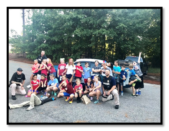
Elementary School Children Visit the Pinehurst Police Department

The Police Chief reports directly to the Village Manager and is a member of the senior leadership team. The Police Department is responsible for the protection of life and property of the citizens and visitors of the Village. Patrol officers respond to police related calls for service at the request of citizens or other persons, initiate service calls when necessary, direct traffic when needed, and conduct follow up investigations on reported and non-reported crimes. Dispatcher personnel monitor, receive, and dispatch emergency and routine police calls for service through an interface with the Moore County E911 system. Investigative personnel are responsible for the investigation of criminal activity in the Village by means of interviews and gathering physical evidence. The Police Department provides dedicated and compassionate assistance by promoting leadership, cooperation, and creativity and aspires to improve the quality of life in partnership with the community.