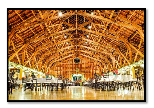
A Wedding Reception at the Fair Barn

The Fair Barn Division of the Parks and Recreation Department provides the management for the operations and maintenance of the Fair Barn. The Fair Barn is the oldest surviving early twentieth-century fair exhibition hall in North Carolina. It was built in 1917 and has been renovated to serve as a multipurpose community gathering place. The division also manages varying capital improvements to the facility and surrounding grounds and provides marketing and promotion for the Fair Barn.