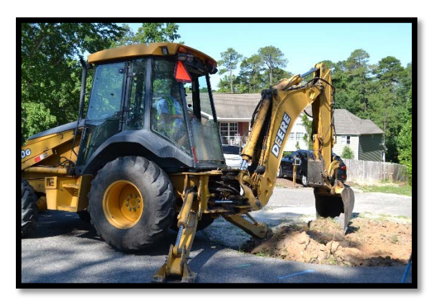
Streets & Grounds Employee at Work

The Streets & Grounds Division of the Public Services Department reports to the Assistant Public Services Director. The Streets & Grounds Division is responsible for keeping all public transportation routes open and in a safe traveling condition. This department maintains 107 miles of streets in the Village, the largest amount of any local government in Moore County. Routine tasks include asphalt patching, installing and maintaining storm drains, installing and maintaining traffic and street name signs, repairing sidewalks, street sweeping, and tree trimming. This division also provides the manpower, supplies and management for the maintenance of the Village owned right of ways and common areas.