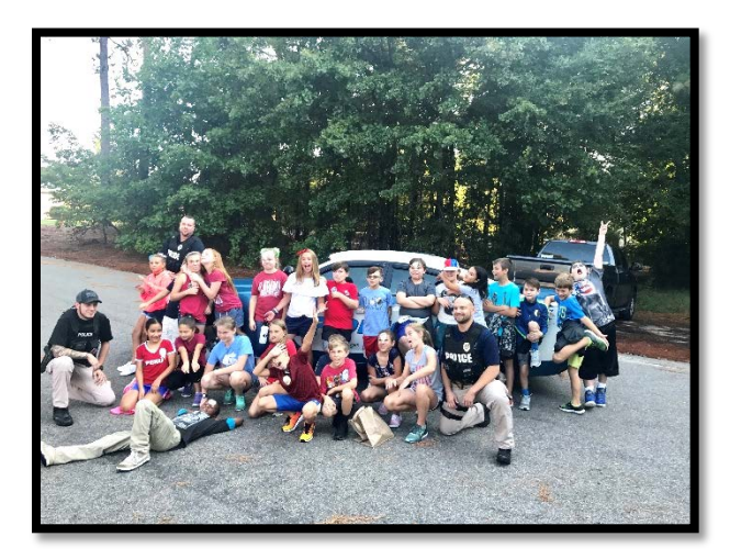
Elementary School Children Visit the Pinehurst Police Department

The Police Chief reports directly to the Village Manager and is a member of the senior leadership team. The Police Department is responsible for the protection of life and property of the citizens and visitors of the Village. Patrol officers respond to police related calls for service at the request of citizens or other persons, initiate service calls when necessary, direct traffic when needed, and conduct follow up investigations on reported and non-reported crimes. Dispatcher personnel monitor, receive, and dispatch emergency and routine police calls for service through an interface with the Moore County E911 system. Investigative personnel are responsible for the investigation of criminal activity in the Village by means of interviews and gathering physical evidence. The Police Department provides dedicated and compassionate assistance by promoting leadership, cooperation, and creativity and aspires to improve the quality of life in partnership with the community.