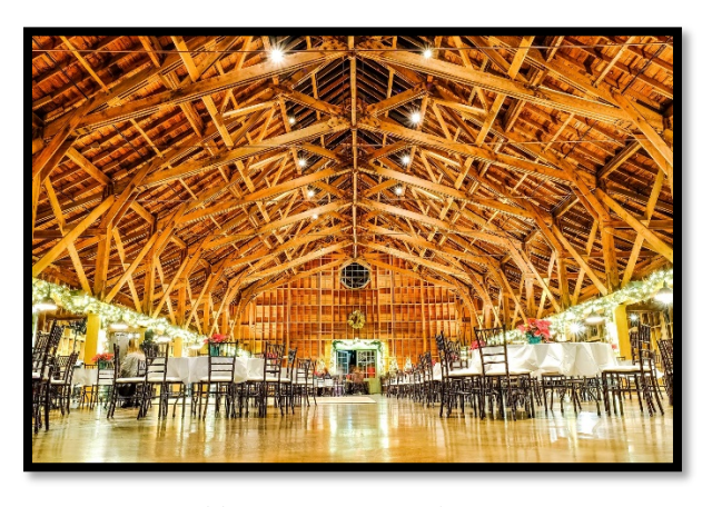
A Wedding Reception at the Fair Barn

The Fair Barn Division of the Parks and Recreation Department provides the management for the operations and maintenance of the Fair Barn. The Fair Barn is the oldest surviving early twentieth-century fair exhibition hall in North Carolina. It was built in 1917 and has been renovated to serve as a multipurpose community gathering place. The division also manages varying capital improvements to the facility and surrounding grounds and provides marketing and promotion for the Fair Barn.