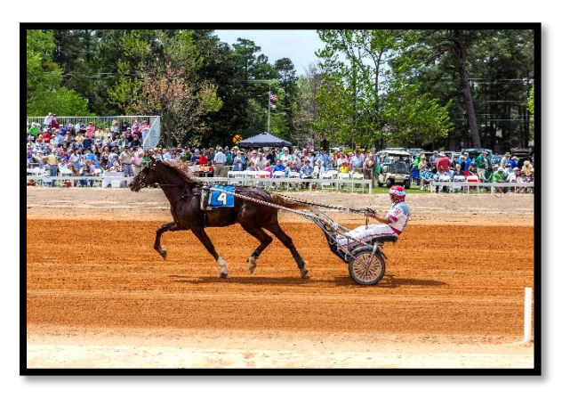
Matinee Race at Harness Track Facility

The Harness Track Division of the Parks and Recreation Department provides the labor, supplies, expertise, equipment, and management for the operations and maintenance of the Harness Track facility. This division manages major and minor capital improvements while providing services to the standardbred trainers and other equine and non-equine related clients of the property. The facility consists of multiple harness tracks, a show ring, and 260 horse stalls in 17 barns. In 2015, the Village celebrated the Harness Track's 100<sup>th</sup> anniversary.