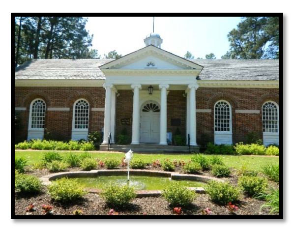
Given Memorial Library

Library services in the Village are provided by the Given Memorial Library, a non-profit 501(c)3. The Village makes an annual contribution toward the operational costs of the Library and has contributed to its capital expansion campaign. The library functions as a free public library and has a collection of over 23,000 items including fiction, non-fiction, audio books, e-books, and reference materials. In 2015, the library opened the Given Book Shop in the former post office downtown. The facility serves as a used book store, coffee shop, and community gathering place. The Library also serves as the curator of the Tufts Archives and the Pinehurst History Museum.