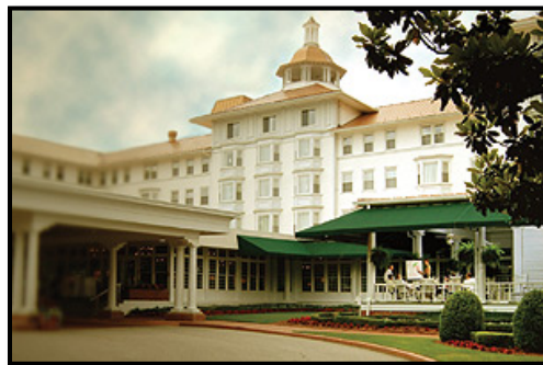
The Carolina Hotel

GASB 44 requires comparative data for the current calendar year and nine years prior. 2010 adjusted Census Data was used for 2009 and 2018 to estimate the percentage of total employment.