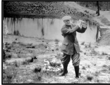
Donald Ross